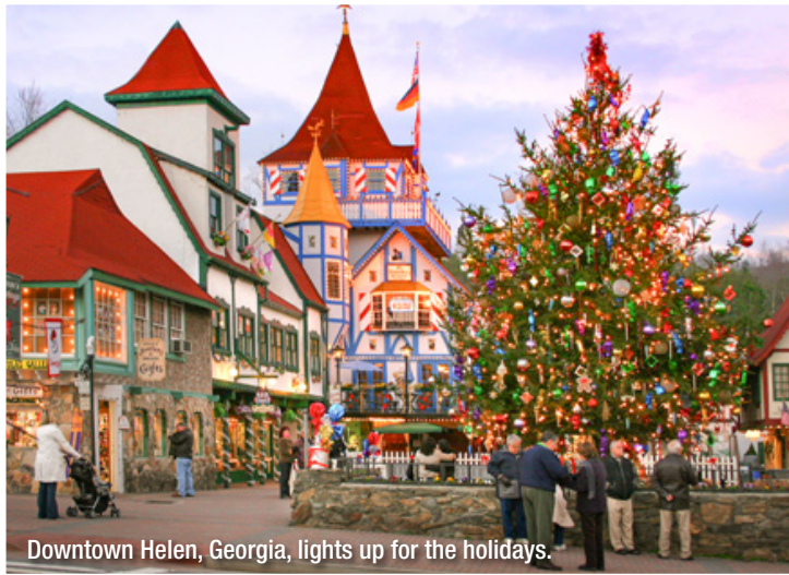
Downtown Helen, Georgia, lights up for the holidays.