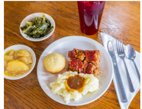
CLOCKWISE FROM TOP: Jane Reed's Pleasant Shade Cafe offers traditional country cooking in a relaxed atmosphere.

Meatloaf is one of the favorites at the cafe.