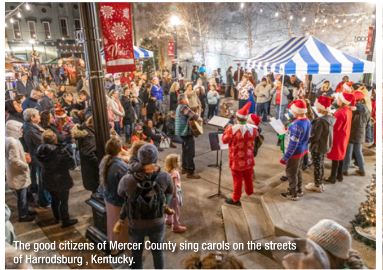
The good citizens of Mercer County sing carols on the streets of Harrodsburg, Kentucky.